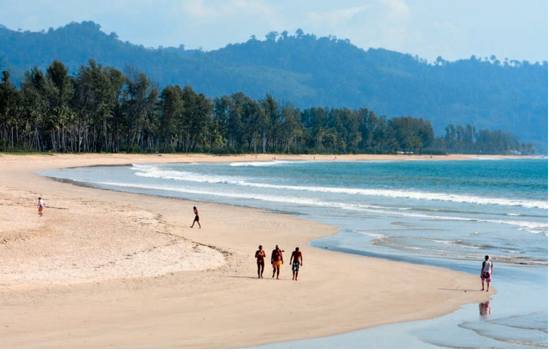
Hat Khao Lak