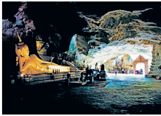
Wat Suwan Khuha