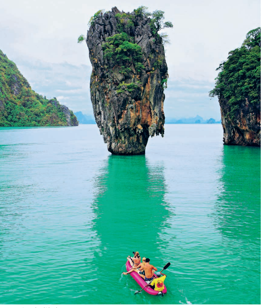
James Bond Island