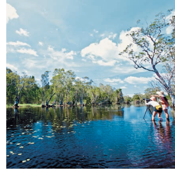
Ko Phra Thong

covers an area of approximately 137.6 square kilometres. Most of its dwellers are Thai Muslim. Ko Yao comprises 2 main islands; namely, Ko Yao Noi and Ko Yao Yai. In addition, homestay accommodation is available both on Ko Yao Yai and Ko Yao Noi. Visitors can enjoy while learning the folk way of living and daily activities such as fishing, clam catching, and biking along a nature trail. For more information, please contact the Ko Yao Noi Ecotourism Club, Bang Rong Pier, Tel. +66 7659 7244, or Khun Samroeng Rakhet, Tel. +66