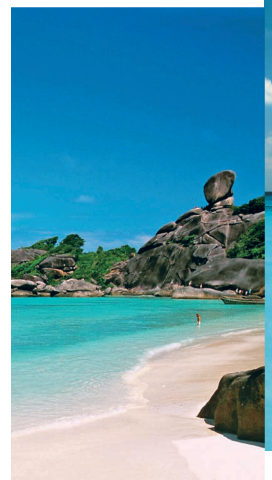
Muko Similan National Park

This cave is located within the grounds of Wat Phra Phat Phra Chim Kaet behind the Provincial Hall. Inside are stalagmites, stalactites and a stream that runs all year round. Two-hour excursions on foot, kayak, or raft through the cave are available. Contact Thongthae Sea Canoe Tel. +66 8 6683 6844.