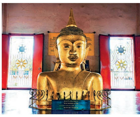
Wat Phra Thong

Located near the Two Heroines Monument, the museum contains a collection of exhibits of ancient artefacts and other materials illustrating life in Phuket in the past. Open except public holidays from 9.00 a.m. – 4.00 p.m. For more information, Tel. +66 7637 9895-7.