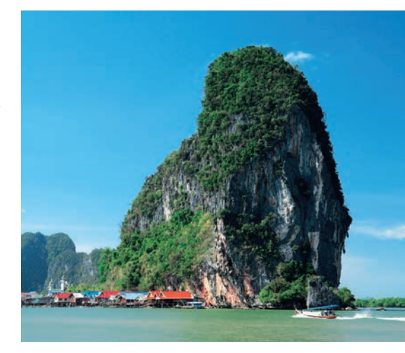
Ko Panyi, Ao Phang-nga National Park

Designated as a marine national park in 1981, Ao Phang-nga covers a coastal and offshore area. Mangrove forests are found along the shoreline. However, the most striking feature is the bay, which is dotted with more than 100 islands, weirdly shaped limestone outcrops swathed in tangles of creepers, shrubs, and mostly uninhabited. Some rise sheer from the water, others are humped or jagged, and