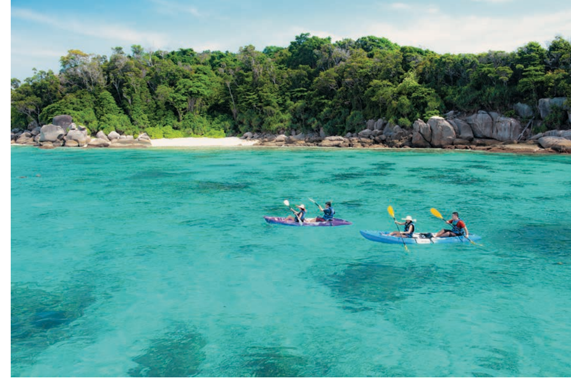
Muko Similan National Park

-Thai Airways International, Tel. +66 2356 1111;