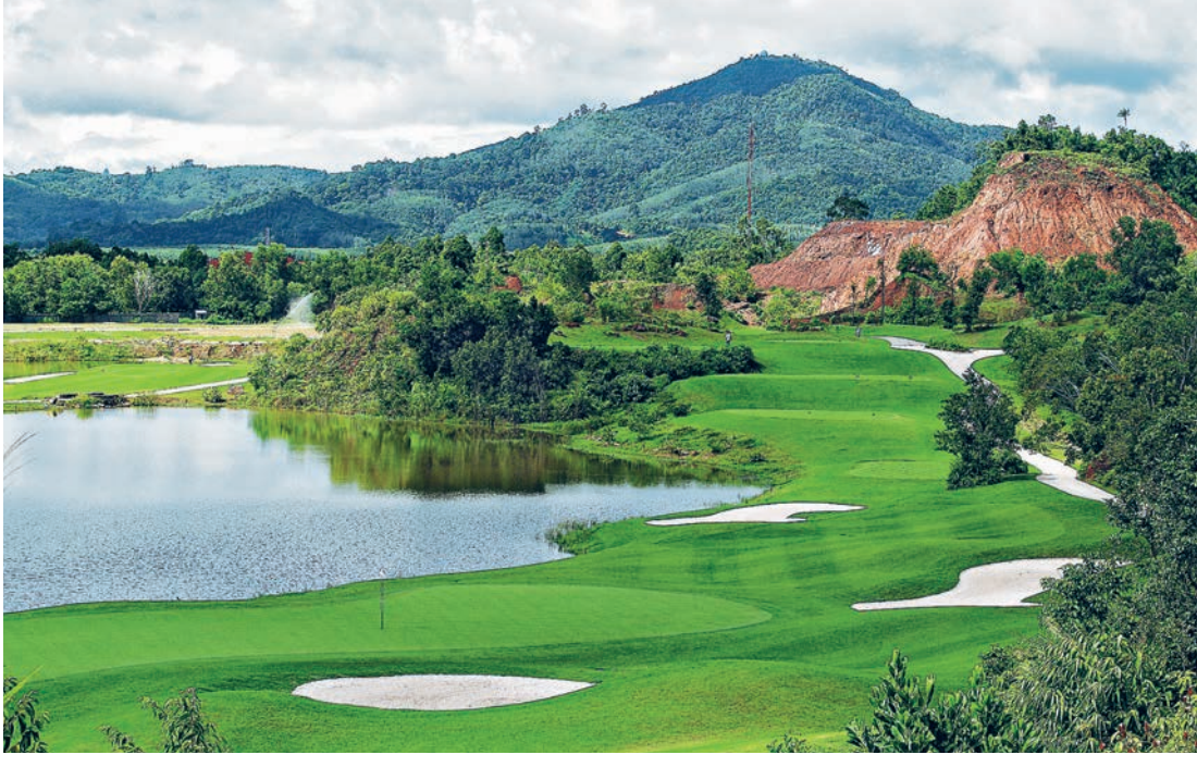
Red Mountain Golf Club

Several tour operators arrange island tours, visit to pearl farms, island cruises, dive safaris and more. Up-to-date and more information on these and other sightseeing and touring options are available at the TAT Phuket Office Tel. +66 7621 2213, +66 7621 1036.