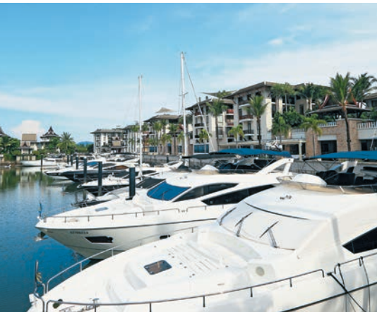
Roval Phuket Marina

This white sandy beach fronts a shallow lagoon between rocky headlands. Conditions for swimming, windsurfing, sailing and sunbathing are all excellent.