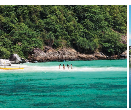
Ko Racha Noi