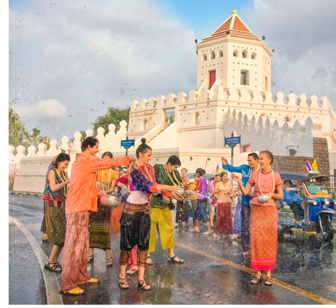
Bangkok Songkran Festival

This event is to celebrate the auspicious occasion of our beloved King's birthday. An alms-giving ceremony in the morning is followed by a huge festival of music and culture at Sanam Luang in Bangkok to celebrate