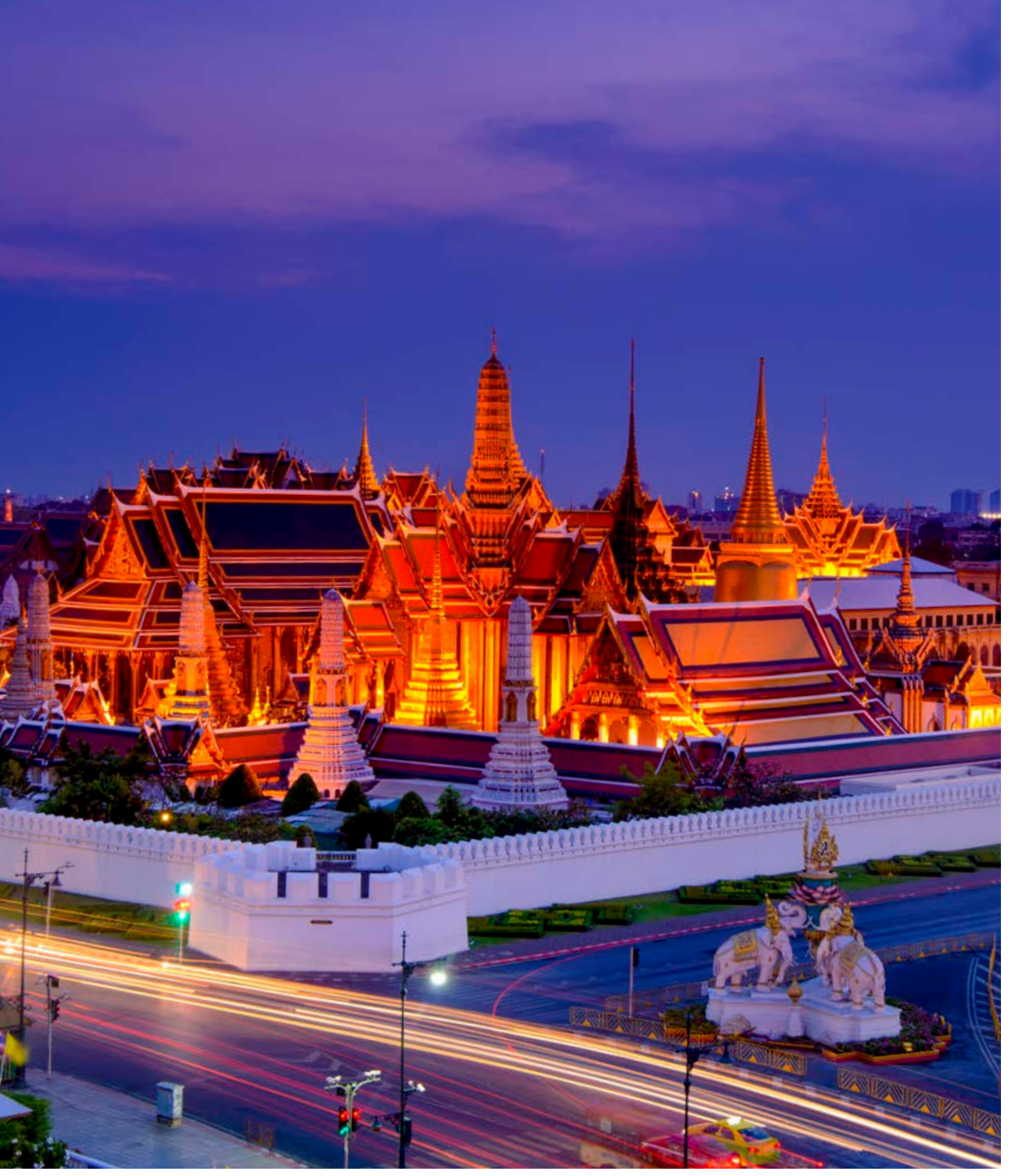
The Grand Palace