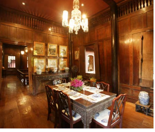
Jim Thompson's House

wish or express appreciation to the God, they will donate wooden elephants or hire a group of Thai classical dancers to perform a dance with live music. The number of dancers and the length of the performance are directly tied to the generosity of their donation. All around plumes of incense smoke rise so thickly that they overcome the traffic fumes at this busy intersection.