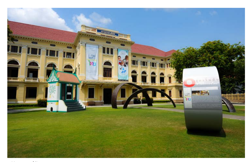
Museum of Siam

Majesty the King's Accession to the throne in 1996. The royal barges were also used during the Rattanakosin bicentennial celebrations and the reception ceremony of the APEC 2003. The shed is open to the public everyday from 9.00 a.m. to 5.00 p.m. Tel. +66 2424 0004