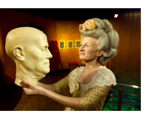
Madame Tussauds Bangkok