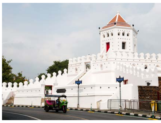
Phra Sumeru Fortress

Located on the corner where Phra Athit Road and Phra Sumeru Road meet, this fortress was constructed in the reign of King Rama I in 1783 along with 14 other fortresses and battlements surrounding the capital. Its shape is an octagonal one with three levels. Inside the walls, there are steps leading up to the fortress. Altogether, there are 38 rooms for ammunition