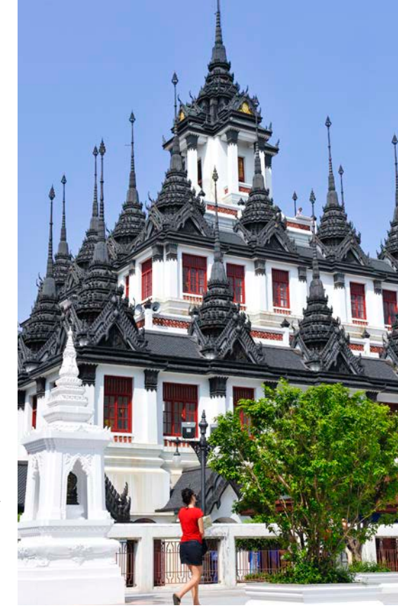
Wat Ratchanatdaram (Loha Prasat)

On each side of the square enclosure, a panoramic view of Bangkok is offered, especially of the Rattanakosin area, the enclave which houses the Grand Palace and other historic buildings. The Golden Mount understandably attracts many visitors.