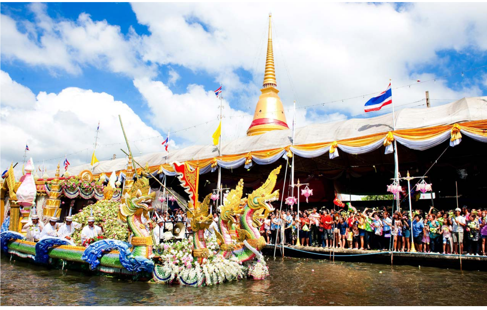
Yon Bua Festival

By air-conditioned buses (of the BMTA Bangkok Mass Transit Authority) Line No. 2 (Sam Rong - Pak Khlong Talat), Line No. 6 (Pak Kret - Phra Pradaeng), Line No. 7 (Sam Rong - Tha Phra), Line No. 8 (Pak Nam - Tha Ratchaworadit), Line No. 11 (Pak Nam - Khon Song Sai Tai), Line No. 13 (Rangsit - Pu Chao Saming Phrai), Line No. 23 (Sam Rong - Thewet via Express way), Line No. 25 (Pak Nam - Tha Chang), Line No. 102 (Pak Nam - Chong Nonsi), Line No.