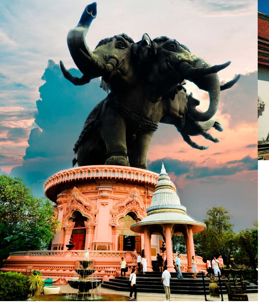
The Erawan Museum