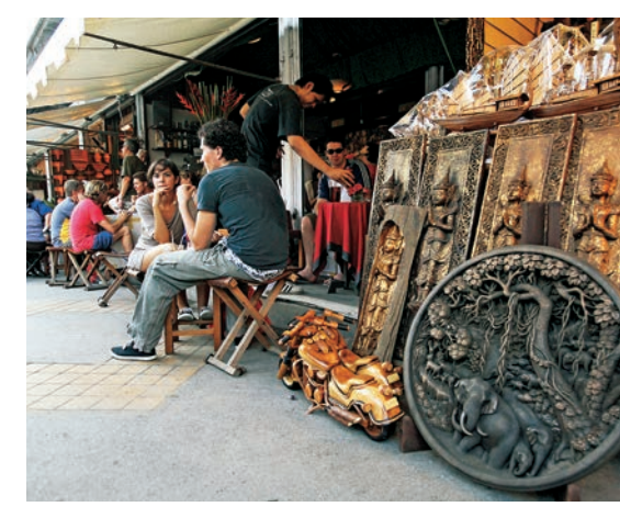
Chatuchak Weekend Market

Reachable by the river taxi, as well as road transport, this market is best known for potted plants and shrubs, especially orchids. On the other side of the street is the fresh market where visitors can enjoy shopping fresh fish, vegetables, fruits, as well as delicious food The best time to visit this market is from late morning to early afternoon.