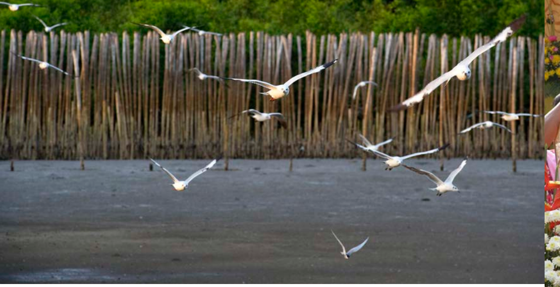
Bang Pu Seaside

complex, located at Km. 33 on Sukhumvit Highway and open everyday from 8.00 a.m. to 5.00 p.m., contains almost-real-scale replicas of religious complexes, monuments and buildings found throughout Thailand. Tel. +66 2709 1644-5, +66 2323 9253 Website: www.ancientcity.com