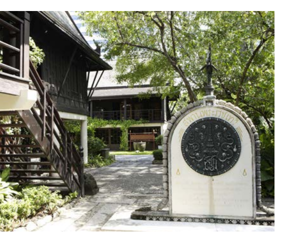
Suan Pakkad Palace & Museum

Loha Prasat stands 36-metres high with 37 surrounding spires, the only one of its kind left in the world. In front of this temple, there is a memorial statue of King Rama Ill and a Pavilion "Maha Chetsadabodin," which is used for performing an official welcoming ceremony to the visit of Heads of States. On the opposite side of the temple, there is Mahakan Fortress, which is a part of an ancient city wall. The temple is open daily from 9.00 a.m. to 5.00 p.m. Admission is free. Tel: +66 2224 8807