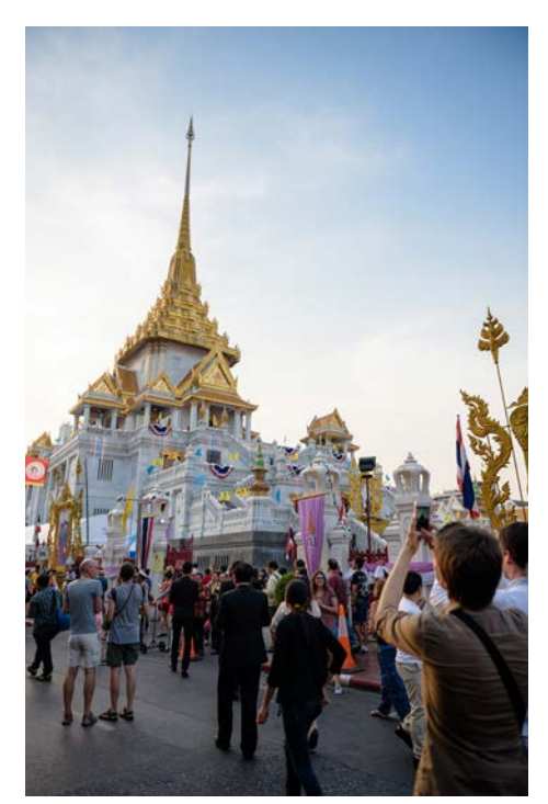
Wat Traimitr (Temple of the Golden Buddha)