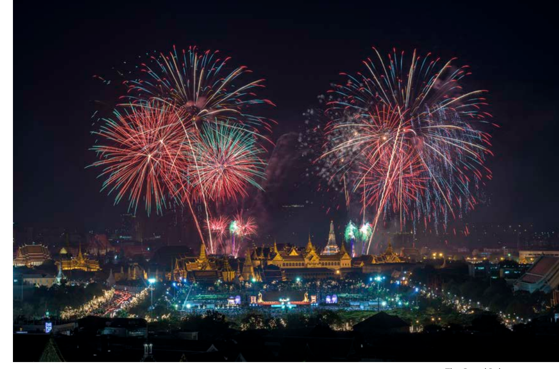
The Grand Palace

Riverine Bangkok offers some of the capital's most superb sights, particularly at night when the weather is cooler and reflections from the water bestow upon Bangkok a magical effect