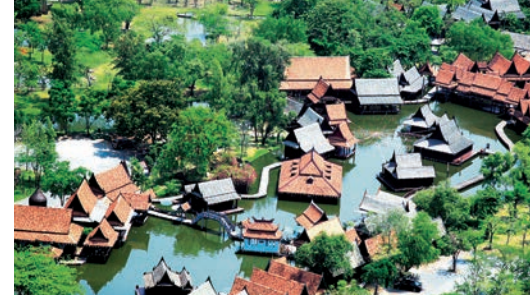
The Ancient City

Opposite the City Hall, this remarkable white