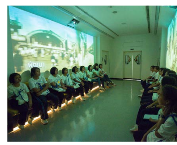
Rattanakosin Exhibition Hall

Near the National Theatre and not far from Sanam Luang, one of the largest and most comprehensive museums in Southeast Asia, the National Museum houses an important