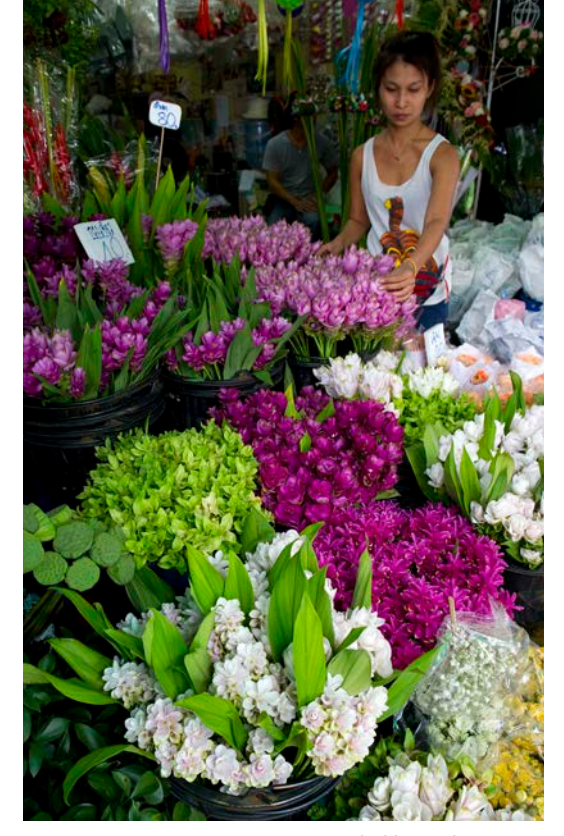
Pak Khlong Talat

Although the street is not very long, Khao San Road is extremely interesting with people