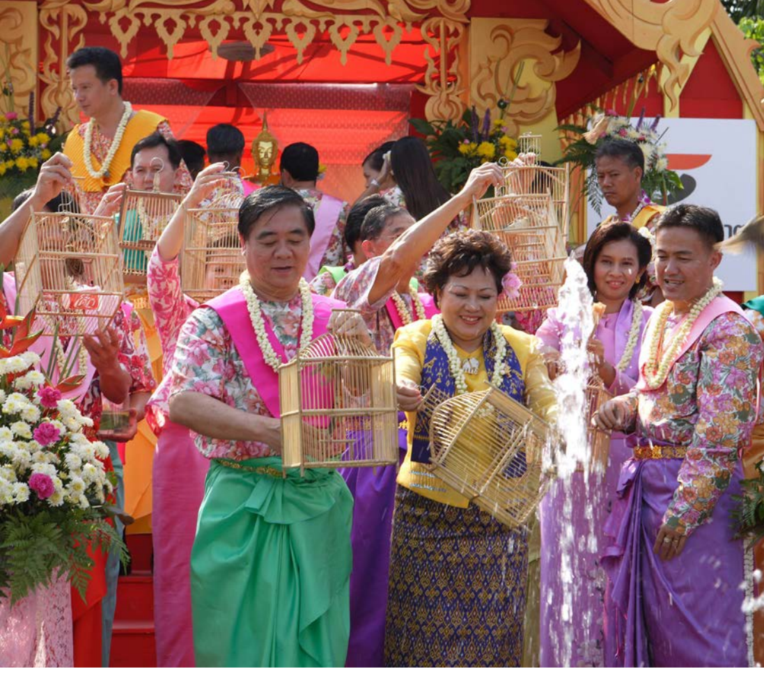
Phra Pradaeng Songkran Festival

Located in the vicinity of Tambon Thai Ban, the complex of more than 60,000 freshwater and marine crocodiles and a mini-zoo also offers an exciting show of keepers playing with these