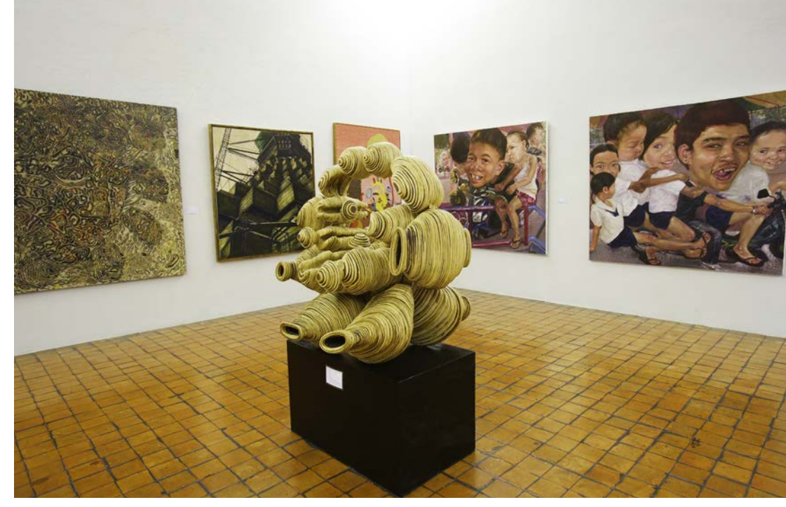
The National Gallery

Major sights to be seen from the river include the Temple of Dawn, the Grand Palace and Thammasat University. The piers for these sights are Tha Chang and Tha Phra Chan. This bustlefree river journey is a welcome difference from the traffic-ridden fumes of the capital, and offers a different and refreshing view of the capital with a fresh river breeze. The express boat