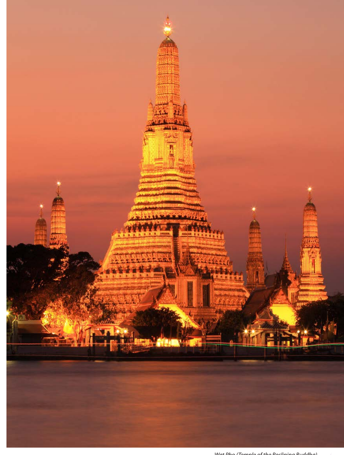
Wat Pho (Temple of the Reclining Buddha)

To visit the temple, shuttle boats from the Tha Tian Pier at the south-west side of the Grand Palace and Wat Phra Kaeo area are provided regularly. The Chao Phraya Express Boat stops at the Tha Tian Pier and there are several Thon Buri canal tours, which include the temple. The temple is open from 7.30 a.m. to 6.00 p.m. Website: www.watarun.org