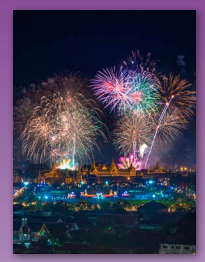
Phra Sumen For Thailand Countdown