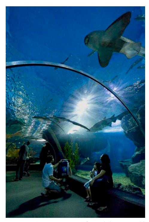
Sea Life Bangkok Ocean World

Situated on Rama V Road, in the Dusit District, near the Royal Plaza, Bangkok's oldest zoo contains a collection of popular African and Asian mammals and birds in a botanical garden. With an additional section for children, it is ideal for a family outing. The zoo is open everyday from 8.00 a.m. to 6.00 p.m. Tel. +66 2281 2000, +66 2281 9027-8 Website: www. dusitzoo.org