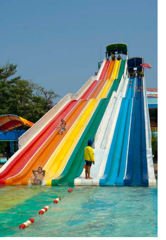
Siam Park City

where you can enjoy some pristine moments. The park is open from 5.00 a.m. to 7.00 p.m. Tel. 0 2328 1385-6, 0 2328 1395 Website: www. suanluangrama9.or.th