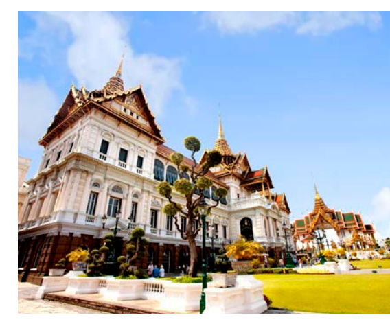
The Grand Palace & Wat Phra Kaeo (The Temple of the Emerald Buddha)

Bangkok takes great pride in its large number of fascinating temples around the capital. The major ones can be found in the Rattanakosin